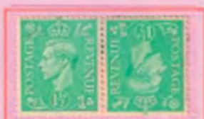
1950 1.5d tête-bêche pair