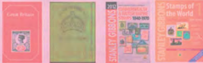
Portrait of Stanley Gibbons with some of the publications that have made his name a household word

Gibbons was born in Plymouth and became one of the great pioneers in British Philately. During a lengthy career which he shared with six wives, he engaged in certain philatelic practices not now considered completely reputable.