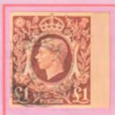
1948 £1 brown imperf