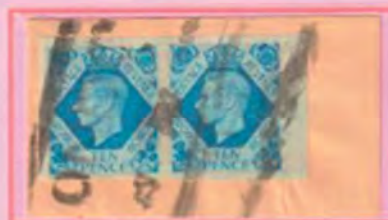
1939 10d imperforate pair