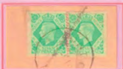
1939 7d imperf on three sides