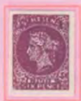
A genuine 1s on 6d from the original Perkins Bacon plate

Some years ago whilst I was studying the forgeries of St Helena, I felt it would be a good idea to produce my own forgery and thus be able to appreciate the efforts of those who came before me. I contacted the Crown Agents seeking permission to produce a facsimile based on the first issues of St Helena. Permission was granted and a copy of their letter is attached over leaf. The 17th facsimile was so called as I had established that there were already 16 types.