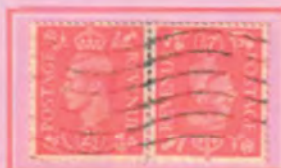
1950 2.5d tête-bêche pair