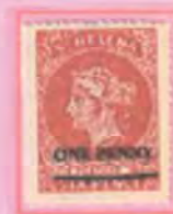
A selection of 17th facsimiles

From a typographic block of 15 images, seven basic colours were used and were variously surcharged in a similar manner to the originals. Some of the classic errors were copied and bogus overprints were also applied. Attempts were made to age the paper, impress watermarks and perforate. Cork cancels similar to genuine types were made and several covers from the period were produced.